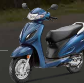
Pearl Siren Blue