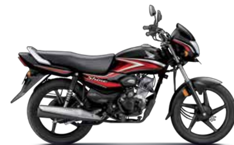
Black With Red