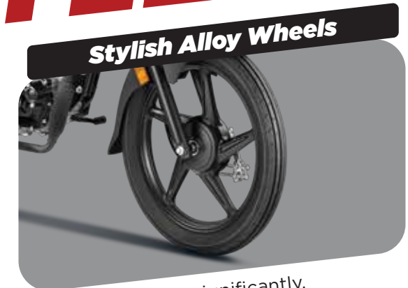
Stylish Alloy Wheels