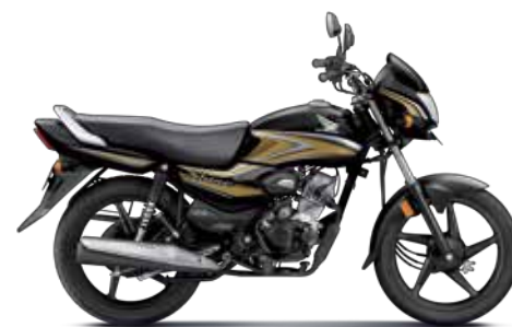
Black With Gold