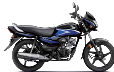
Black With Blue