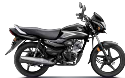
Black With Grey

BOOK ONLINE NOW! www.honda2wheelersindia.com