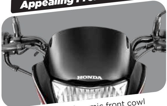
Appealing Front Cowl

Beautiful tank and side graphics increase your shine.