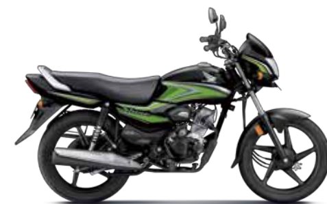
Black With Green